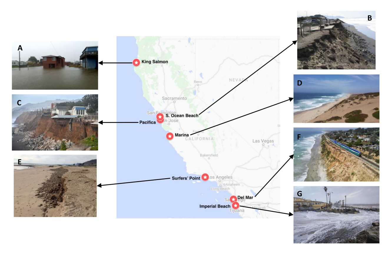
Figure 1. Locations and photographs of managed retreat case studies. ( A ) King Salmon ( B ) South Ocean Beach ( C ) Pacifica ( D ) Marina ( E ) Surfers' Point ( F ) Del Mar ( G ) Imperial Beach.

Receptiveness was measured by the inclusion of managed retreat in the LCP without disclaimers undermining the option to progress to managed retreat (whether managed retreat was ultimately implemented). Resistance was measured by strong opposition at community meetings and the refusal to include a consideration of managed retreat in the LCP or, if included in the LCP, strict qualifiers negating the option of managed retreat.