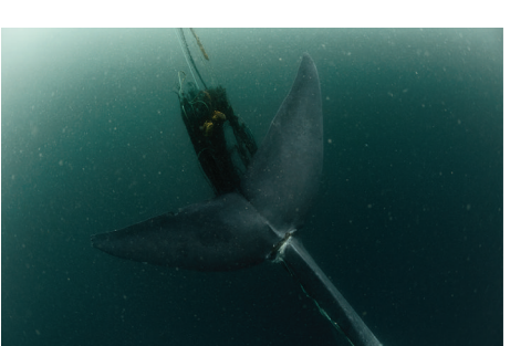
FIGURE 2: Blue whale entangled in large mesh drift gillnet off Mirissa, Sri Lanka, in February 2011.

Observations of stranded and injured baleen whales in the United States and similar observations off Panama have led to a consensus that ship strikes are an important source of mortality, leading to management action that factors whale distributions in locating shipping lanes and mandatory reduction in speeds to minimize incidental mortality for