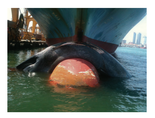
FIGURE 4: Blue whale on bow of container ship in Colombo Harbour, Sri Lanka, on the 20th of March 2012.

to ascertain the cause of death of decomposed beached carcasses, and it is likely that most struck individuals do not strand and sink offshore without being documented [71]. Williams et al. [72] estimated that actual vessel strike mortality to baleen whales could be as much as 10 times higher than observed, depending on location. Given this, it is likely that the events reported by de Vos et al. [70] are a fraction of actual ship strikes, which may be a significant cause of mortality to this population.